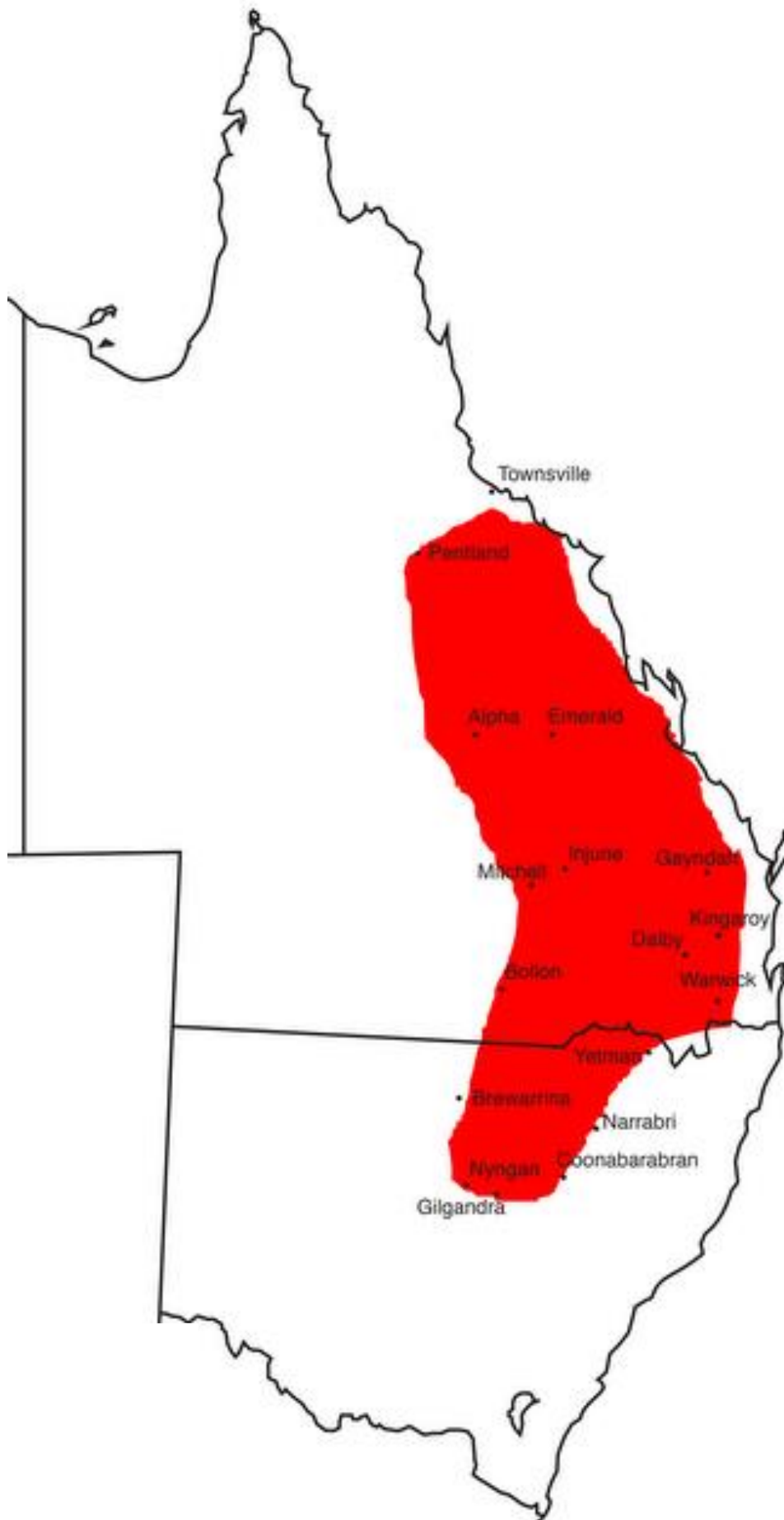
Figure 1. The Qld central and south and NSW northwest region